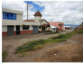
Capillapungu (Pujilí, Cotopaxi)