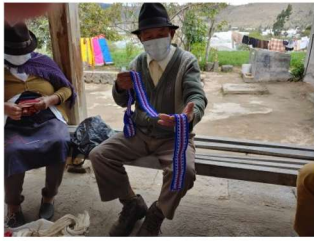
Quilajaló (Salcedo, Cotopaxi)