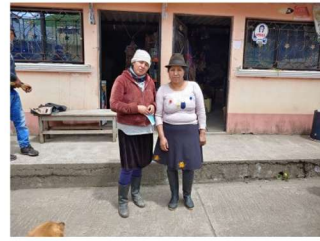
Yacubamba (Pujilí, Cotopaxi)