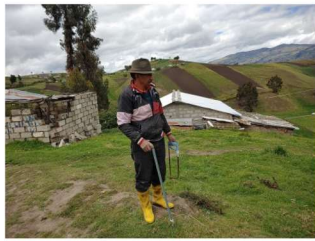
Tuglín (Pujilí, Cotopaxi)