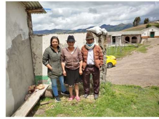
Rayoloma (Pujilí, Cotopaxi)