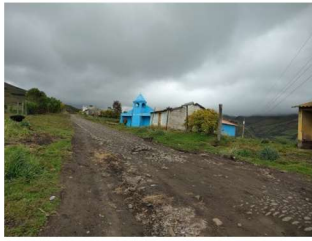
Yanahurcu (Pujilí, Cotopaxi)