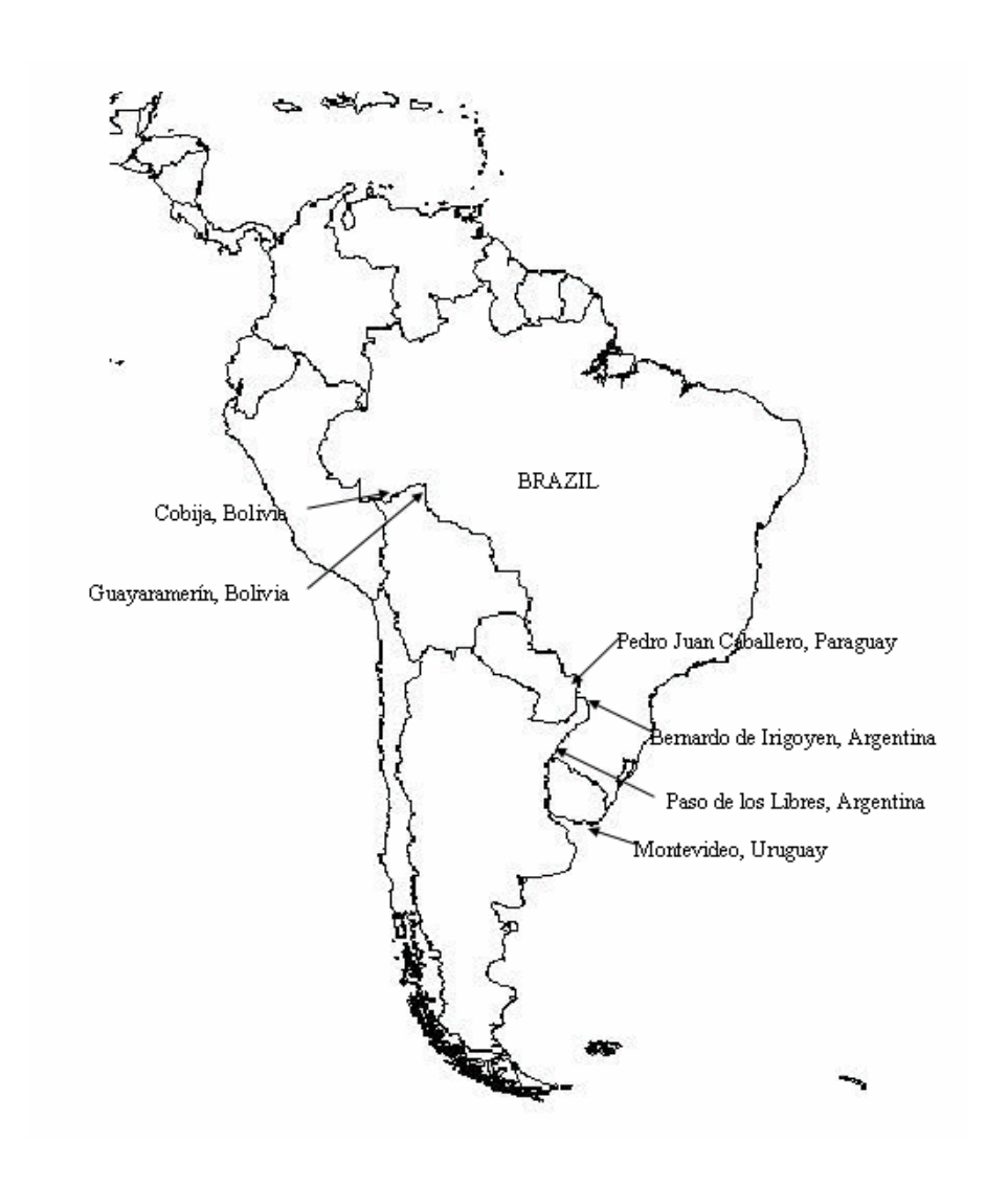
Figure 1. Map showing locations of Spanish-Portuguese and Spanish-Italian language contacts